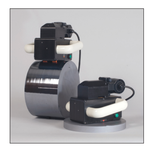
Shock absorbing, retracting pads that conform to ingot curvature enable the BLS-I to measure any surface of as-grown or shaped ingots.

Simple and accurate contactless measurement of true bulk lifetimes on as-grown or shaped silicon.